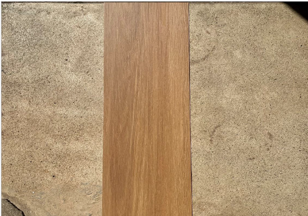
DecoLine Brown Vinyl Board 1220x228x2.5mm