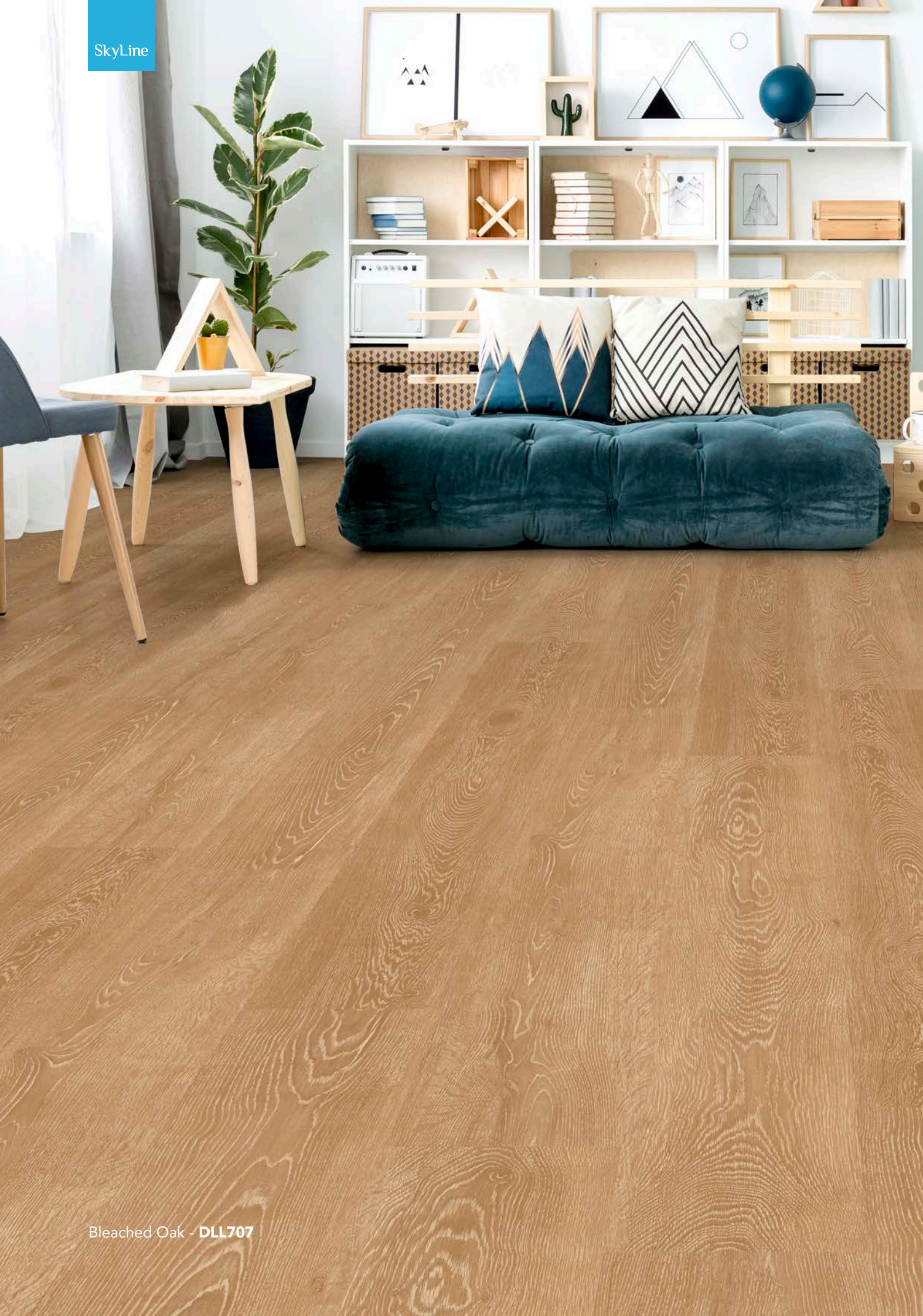
Bleached Oak - DLL707