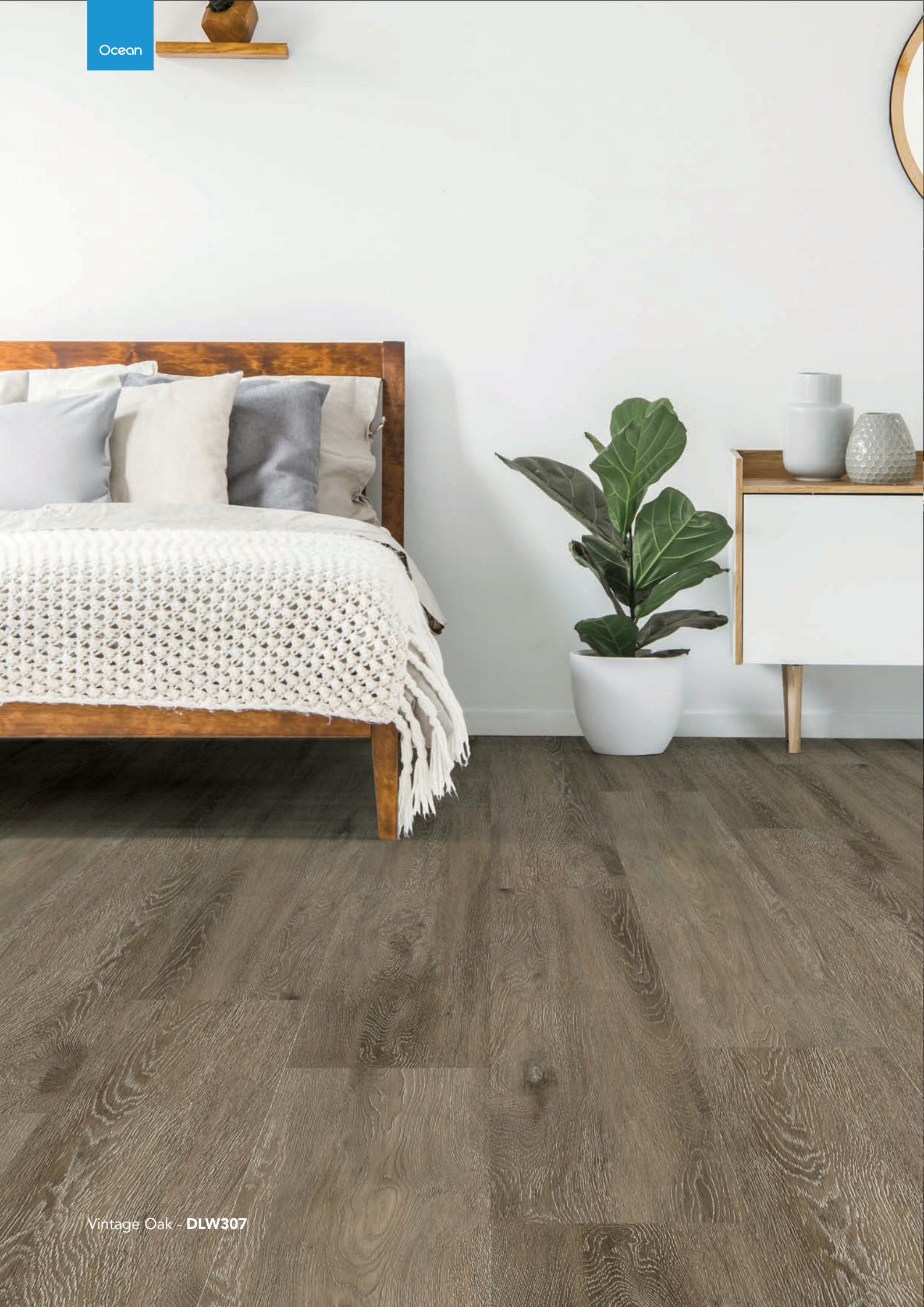
Vintage Oak - DLW307