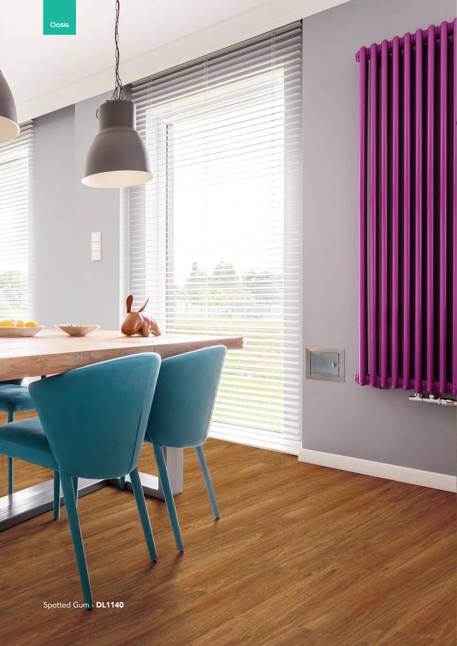
Spotted Gum - DL1140