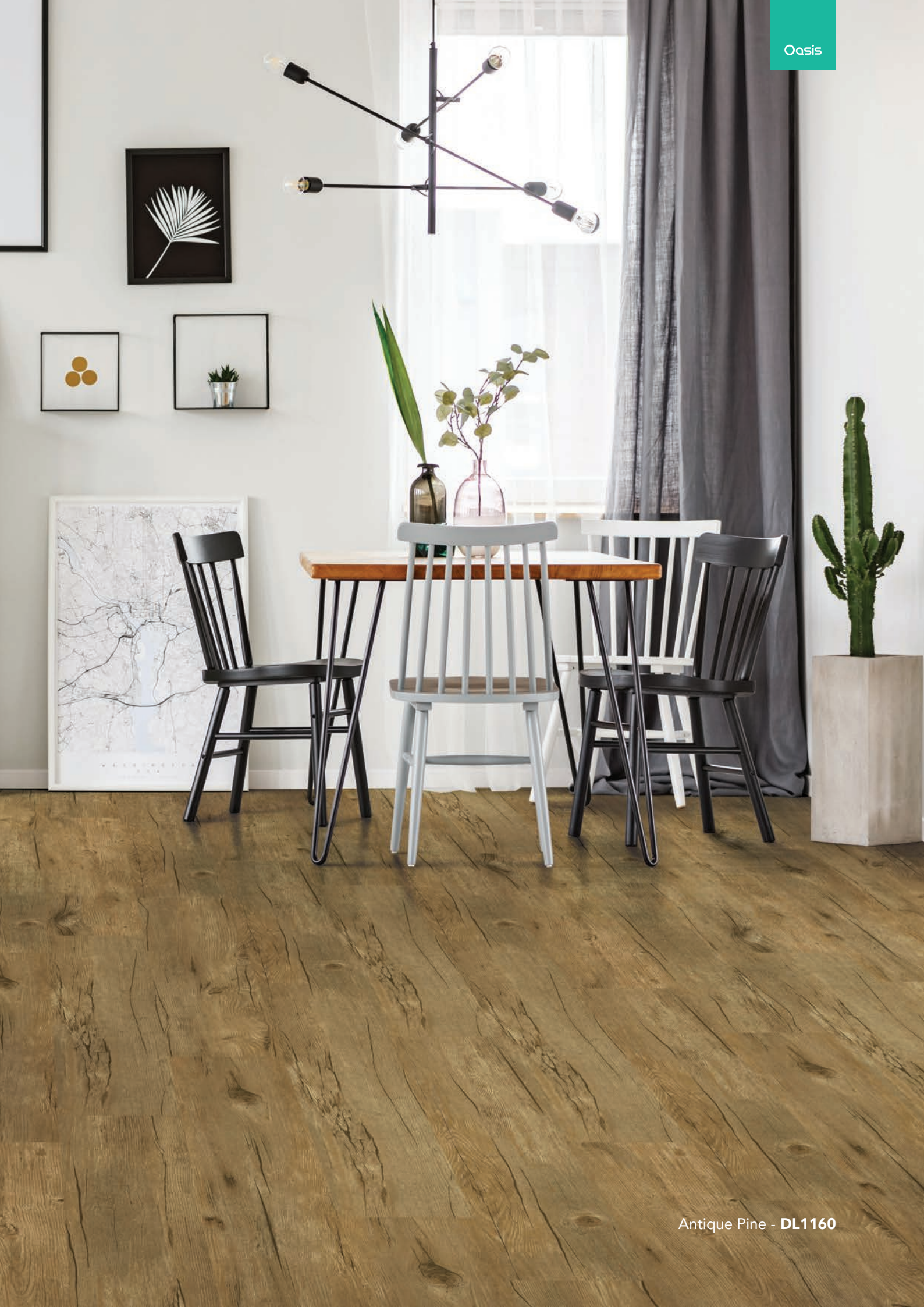
Antique Pine - DL1160