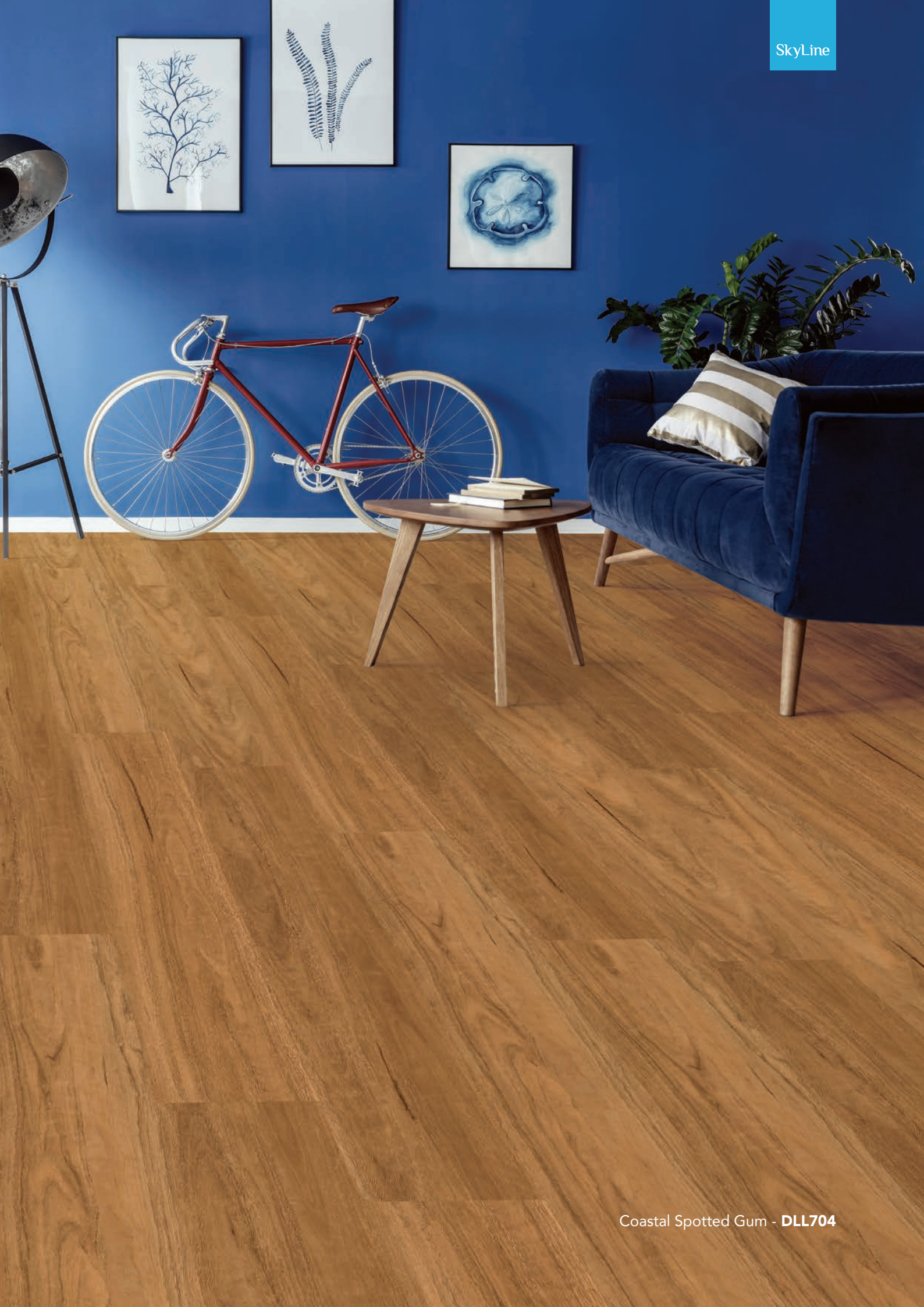
Coastal Spotted Gum - DLL704