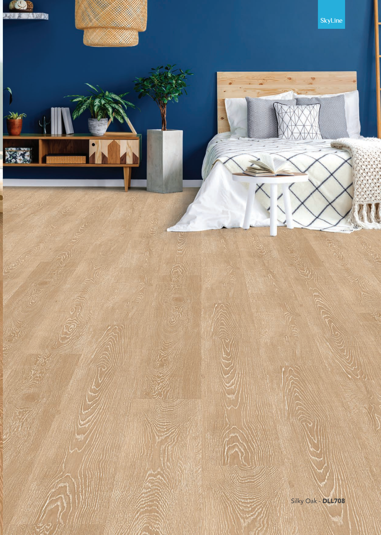
Silky Oak - DLL708