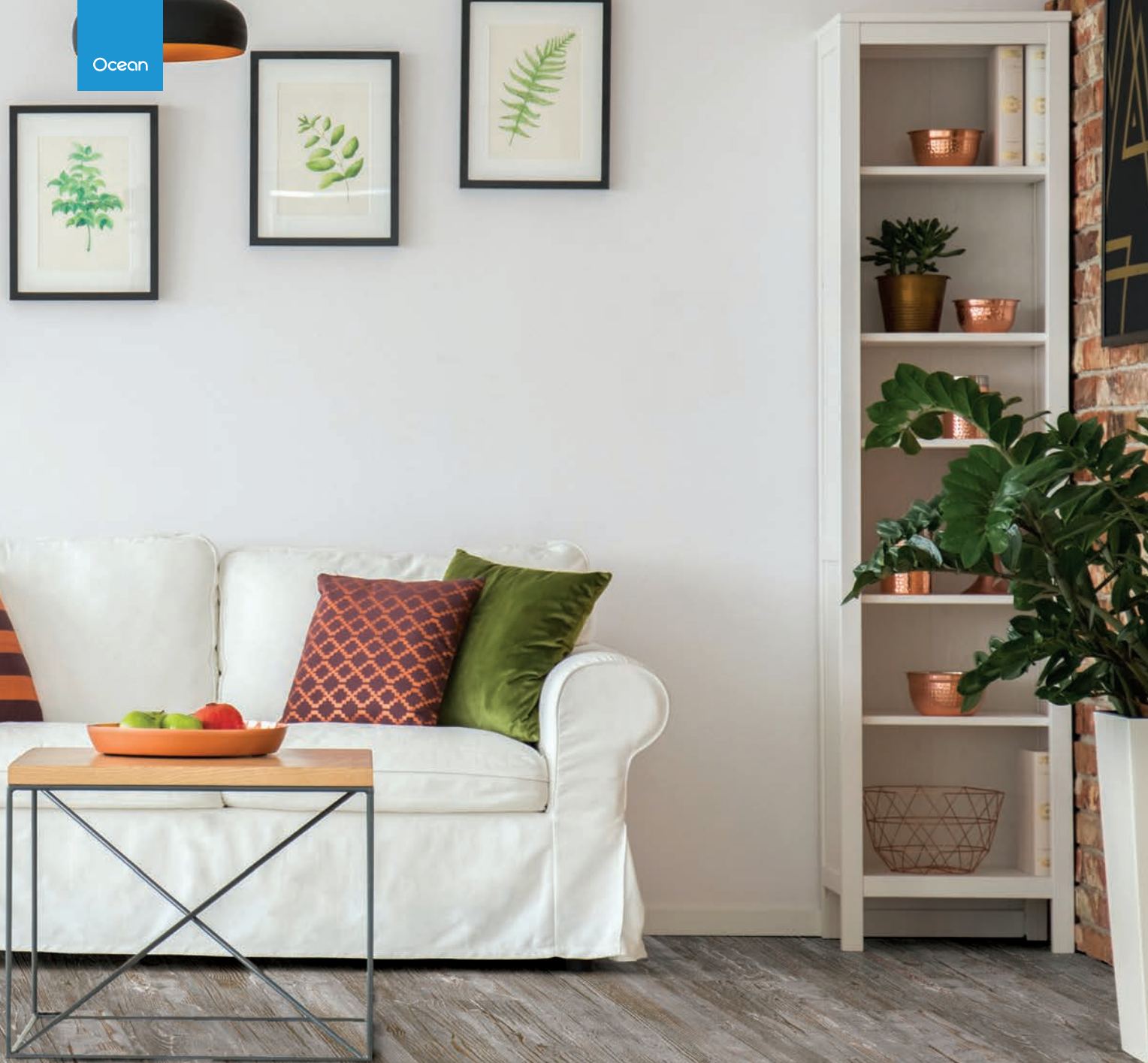
Winter Grey - DLW405