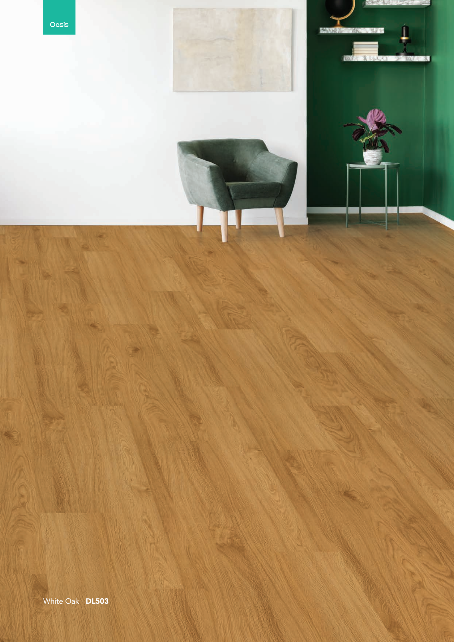
White Oak - DL503