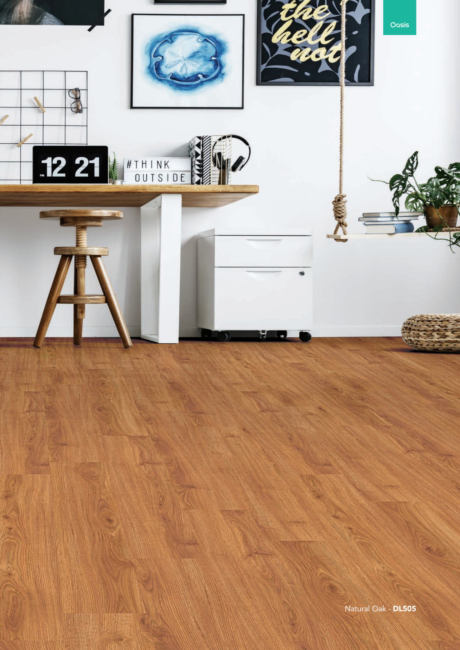
Natural Oak - DL505