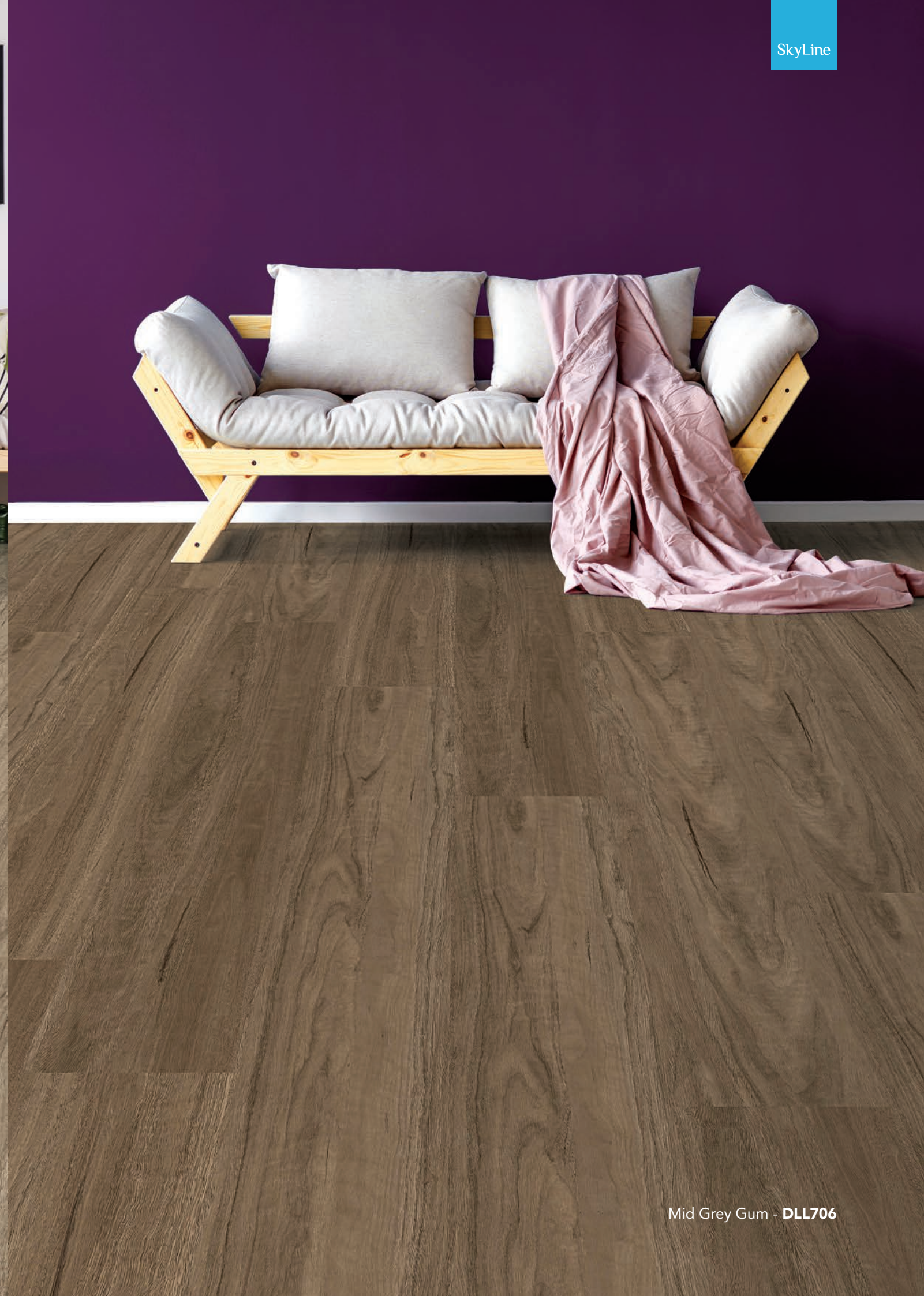
Mid Grey Gum - DLL706