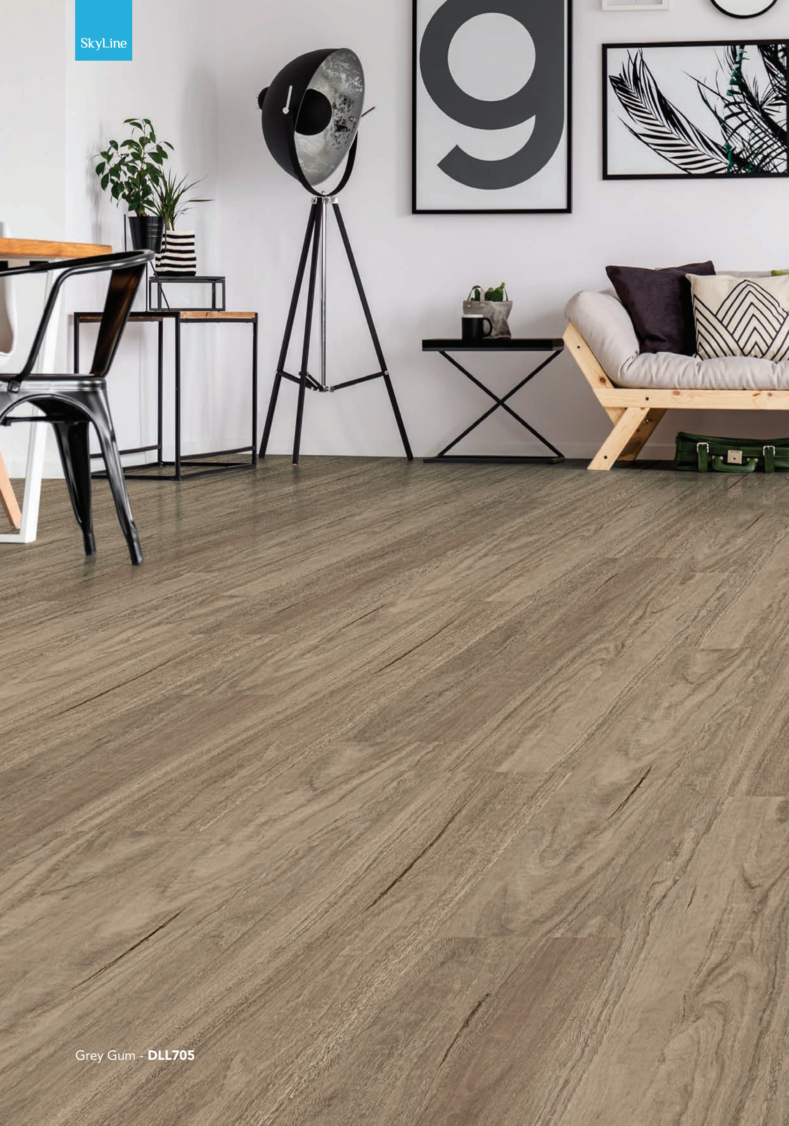
Grey Gum - DLL705