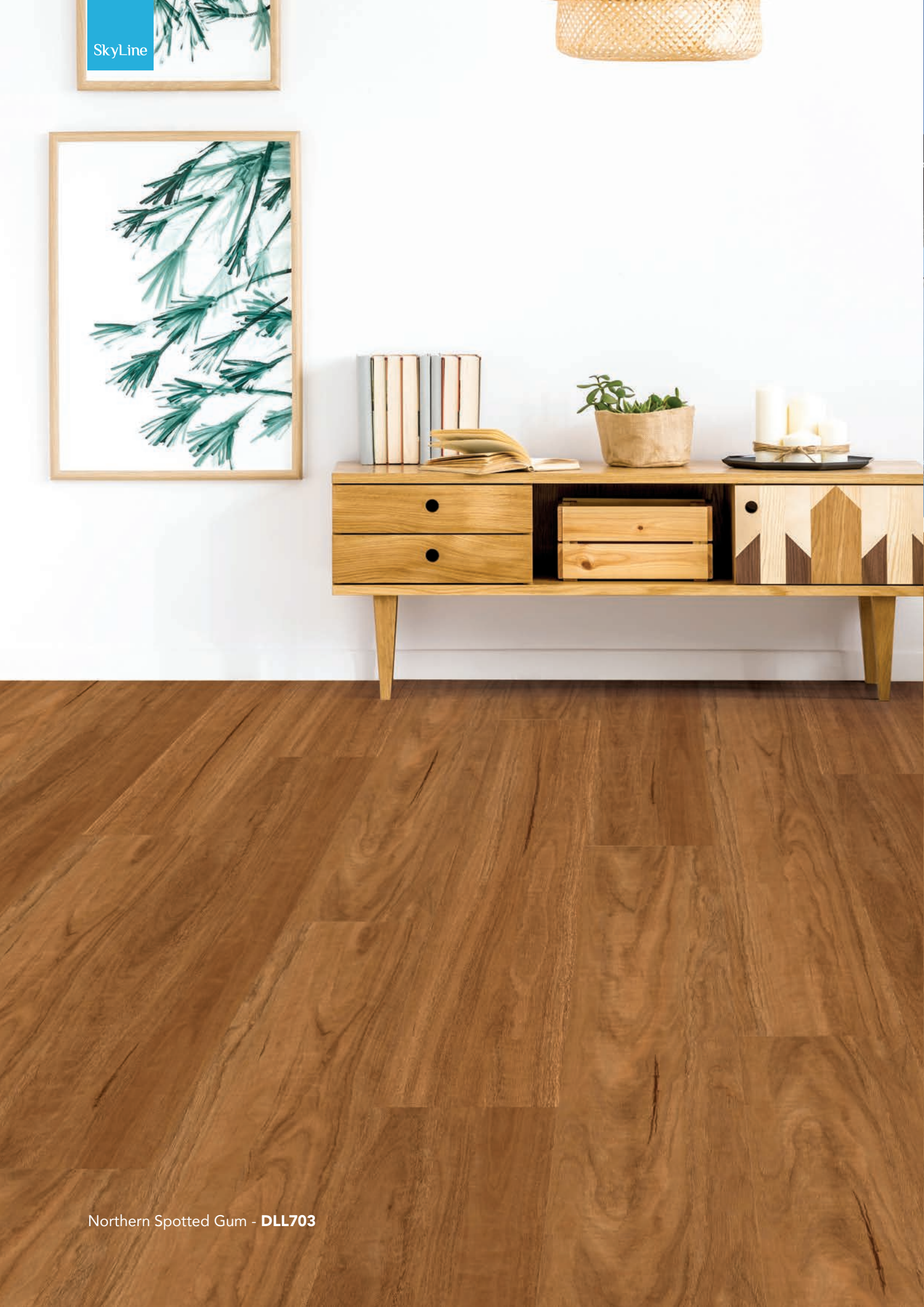
Northern Spotted Gum - DLL703