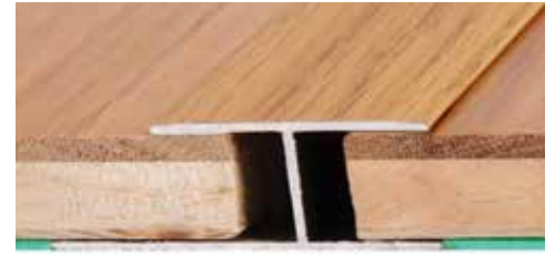
Prestige Profile H-trim * Size: 3400 x 27 x 14 mm