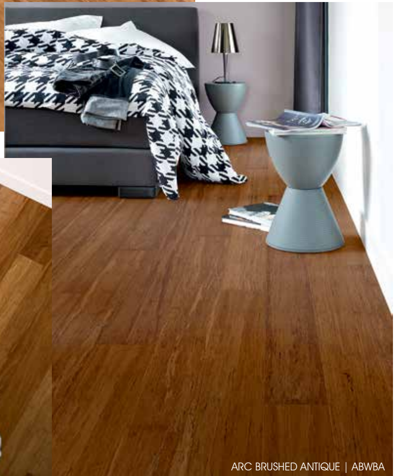
ARC BRUSHED ANTIQUE | ABWBA

Just have a look at our Australiana Bamboo: thanks to the wide planks, the natural variation almost resembles the real look of the popular timber species Spotted Gum.