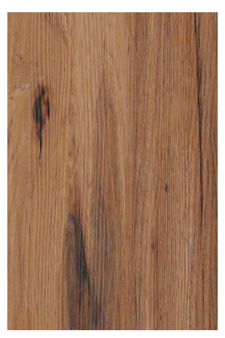
HOMESTEAD SPOTTED GUM