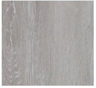
LONG ISLAND SHALE