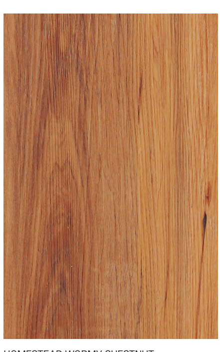
HOMESTEAD WORMY CHESTNUT