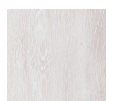
LONG ISLAND OYSTER